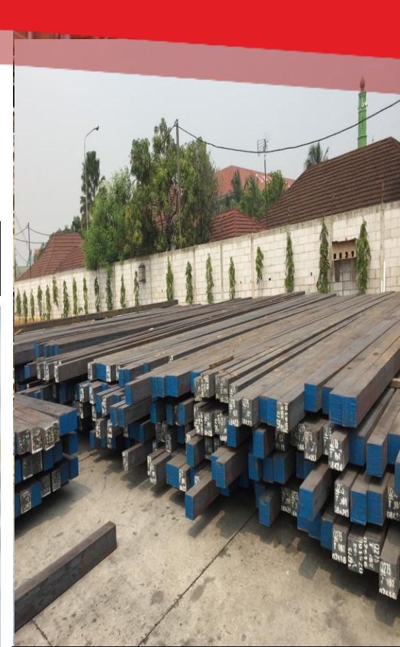
Heavy Cargo Open Storage