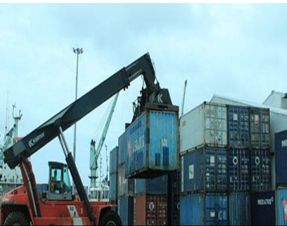
Lift On Lift Off